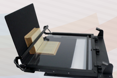
V-Shape Book Holder