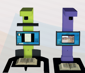
EXAMPLES OF TABLE TOP CONFIGURATION, TO BE INSTALLED ON YOUR OWN TABLE