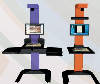
EXAMPLES OF WALK-UP CONFIGURATION, KIOSK FOR SELF-SERVICE USE